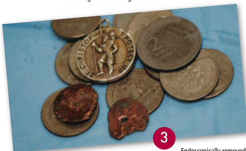
3 Endoscopically removed foreign bodies; note the corroded appearance of the pennies