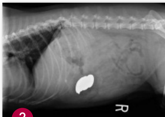
2 Lateral abdominal radiograph revealing metallic foreign bodies

Treatment. Medical reduction of gastric acid production with histamine-2 receptor antagonists or proton-pump inhibitors may decrease zinc absorption until zinc containing foreign bodies can be removed surgically or endoscopically. Induction of vomiting for removal may not be successful and could worsen mucosal damage to